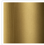
Brushed Gold (BG)